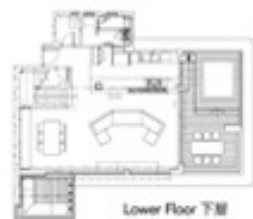
Lower Floor 下層