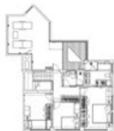
Upper Floor 上層

colours and playful motifs topped with a chandelier in each. Unlike the other rooms of the home, the master bedroom does not have a chandelier and instead a skylight stands out here, working to bring in natural light alongside a large window. In terms of furnishings and decor, there are also a lot of dark woods, and these work against the abundant whites to visually enhance the space. Another central feature here is the large sliding door of the en-suite bathroom which features a large mirror that not only enlarges the visual space and conceals the bathroom, but can also slide away to reveal a wardrobe. The crowning feature on top of the home connected to the master bedroom is the roof, with wooden panels, another Jacuzzi and sun chairs making this a nice private relaxing space. ♦